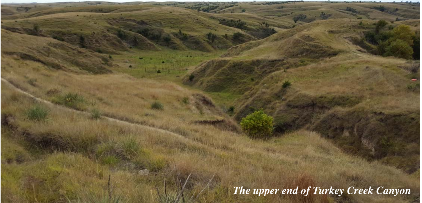
The upper end of Turkey Creek Canyon

The Platte-Republican Diversion Project will divert excess flows (streamflows above and beyond levels needed to fulfill existing water rights and instream target flows for endangered species) from the Platte River through the CNPPID canal system, and then discharge the flows into Turkey Creek, a tributary of the Republican River.